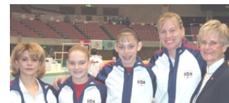
Chunichi Cup, Nagoya, Japan