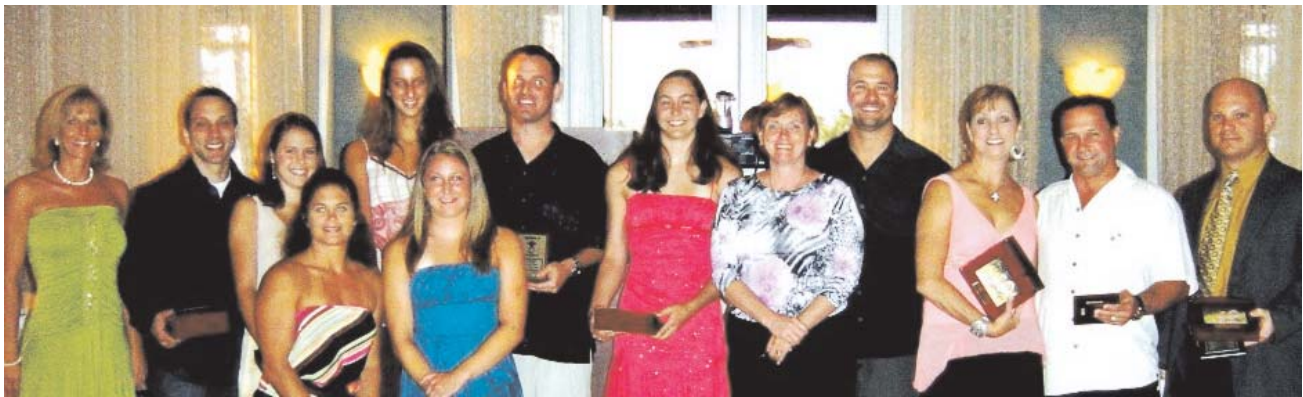
Region 8 National Champions and Coaches attending Region 8 Congress